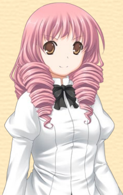
Сиина «Миша» Мукаго

Сильная воля Сидзунэ делает её идеальным лидером. Даже будучи глухонемой, она занимает пост старосты класса и готова разобраться в любой ситуации, которая встанет у неё на пути. Сидзунэ знаменита на всю школу не только как грозный диктатор и умелый манипулятор, но и как честный и справедливый лидер.